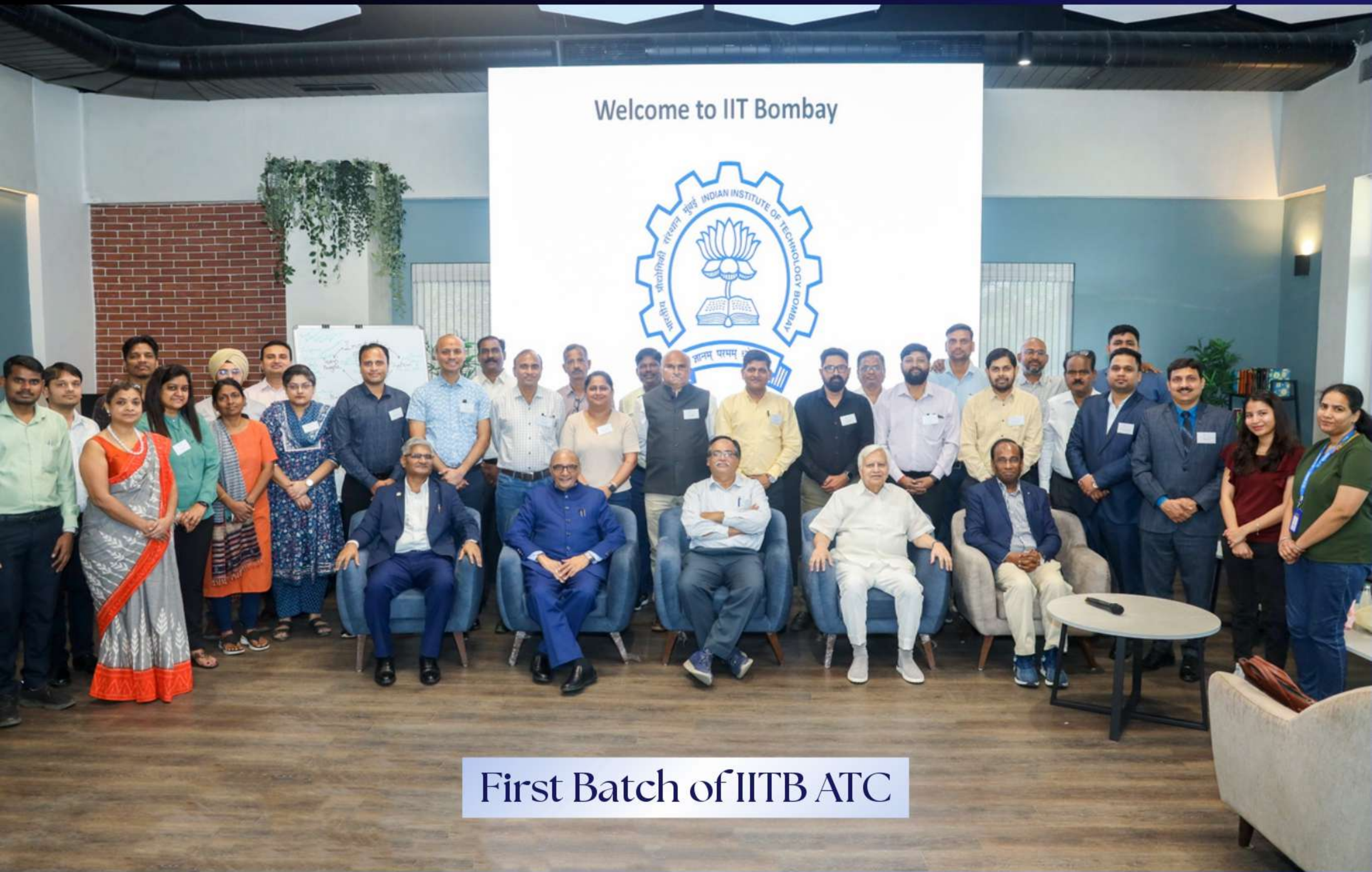
First Batch of IITB ATC