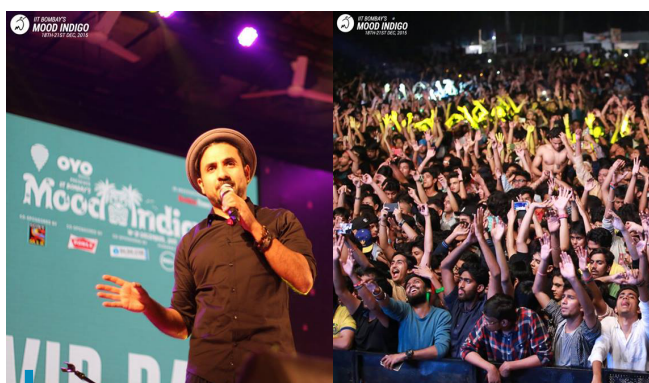
Annual Cultural Festival Mood Indigo at IIT Bombay

The annual cultural festival Mood Indigo held during December 18-21, 2015, saw an overwhelming response from the youth of the country. The fest registered a footfall of 1,31,000.