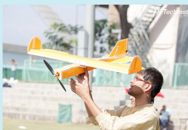
TechFest, an Annual International Science and Technology Festival at IIT Bombay