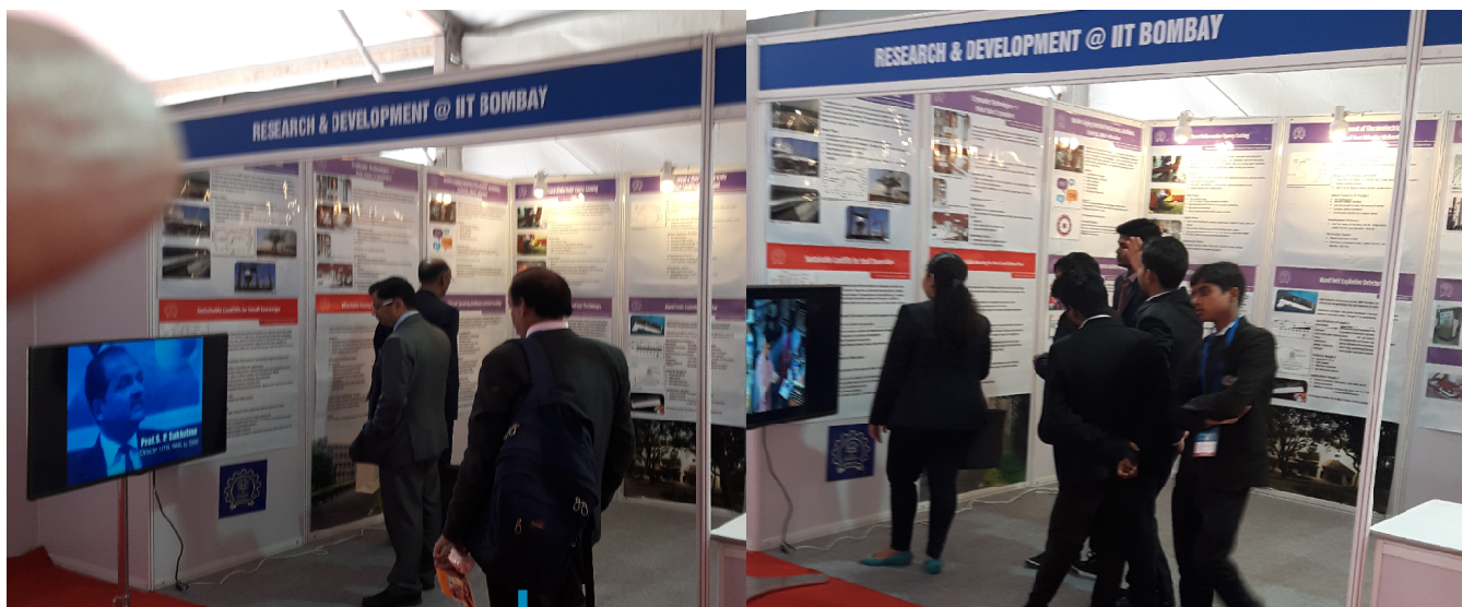
IITB stall at Global R & D Summit 2015

IIT Bombay participated in the Research & Development (R&D) Exhibition organised by the Federation of Indian Chambers of Commerce and Industry (FICCI) and Department of Science & Technology, Government of India in conjunction with the 'Global R&D Summit 2015' at Vigyan Bhawan, New Delhi during December 7-8, 2015. The summit aimed to explore avenues of partnerships for Indian technology based start-ups and build capacities for market assessment and rapid commercialization of research. It also aimed to create unique networking ground for local and global research community and to create avenues for industry-academia-government partnerships by showcasing R&D projects, programs and success stories to the R&D community. The event was inaugurated by Shri. Nitin Gadkari, Hon'ble Union Minister of Road Transport & Highways and Shipping and Shri. Y.S. Chowdary, Hon'ble Minister of State for Ministry of Science & Technology & Earth Sciences, Government of India.