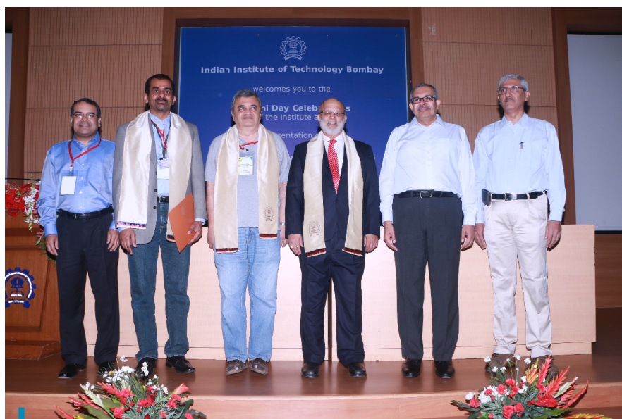
Distinguished Service Awards Winners along with Director, DD (FEA) and Dean (ACR) during Alumni Day Celebration at IIT Bombay